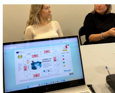
Opportunities for AT-RISK YOUTH